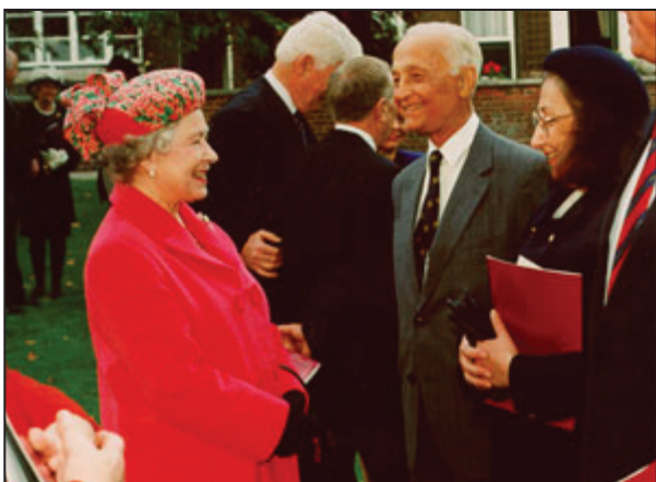
Her Majesty Queen Elizabeth II greets John M. Templeton.

Most of the Foundation's grant-making supports scientific research at top universities, in such fields as theoretical physics, cosmology, evolutionary biology, cognitive science, and social science relating to love, forgiveness, creativity, purpose, and the nature and origin of religious belief. The Foundation also encourages and supports informed, open-minded dialogue between scientists and theologians as they work on the "Big Questions" in their distinctive fields of inquiry.