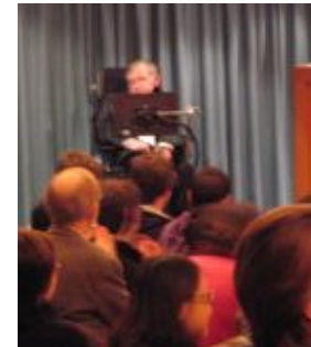
Stephen Hawking introduces the play.